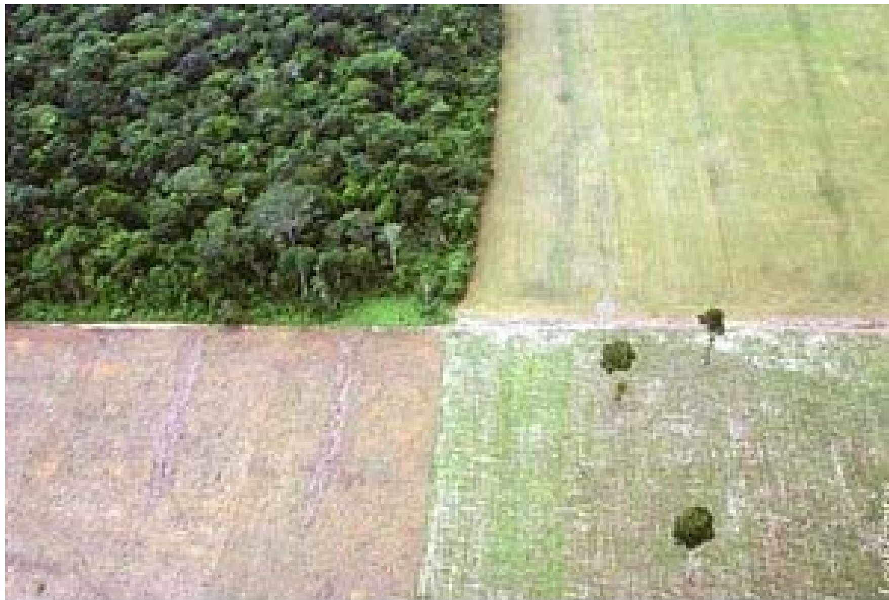
Área desmatada da floresta para o plantio de soja no município de Santarém no Estado do Pará, Brasil.